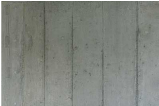
CAST-IN-PLACE CONCRETE BOARD-FORMED