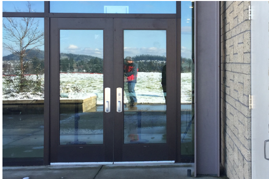
STOREFRONT WINDOWS & DOORS TO MATCH EXISTING