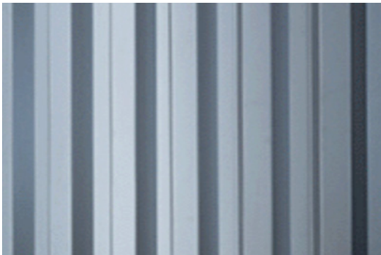
METAL WALL PANEL LIGHT-COLORED FINISH W/ RIBBED PROFILE