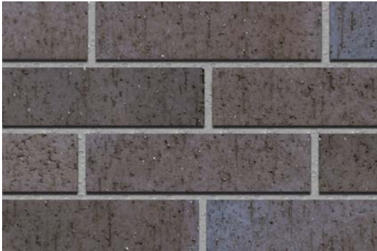
BRICK VENEER RANGED REDDISH GRAYS W/ WIRE-CUT FINISH