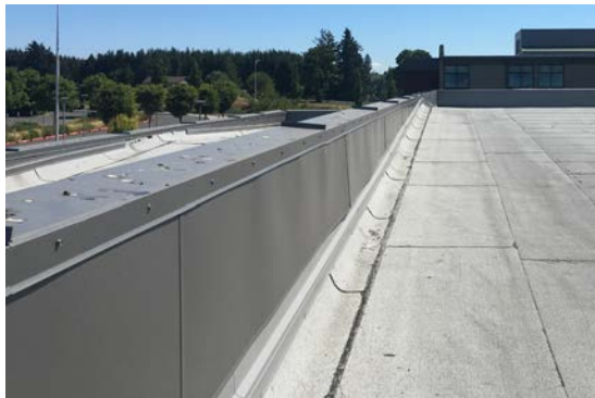
FLAT ROOF WITH PARAPET TO MATCH EXISTING